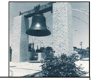
Original Liberty Bell and one Israel Liberty Bell

Yes, like the United States, Israel is a free and open democracy with equal rights for all. There is no discrimination. The media is freely able to report what it chooses, including criticism of the government. Israel has more companies traded on the U.S. stock exchanges than any foreign country after Canada. A walk through the streets of Tel Aviv is almost like being in New York City. All Israeli citizens can vote and serve in Knesset.