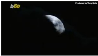
NOW PLAYING < 18 of 27 > HD This Scientific 'Mamira Annrakusa Calculator' Reveals