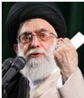
Supreme Leader Ayatollah Ali Khamenei

Remember: No matter how nice the man on the right smiles, the man on the left rules and controls Iran