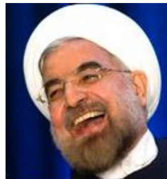
President Hassan Rouhani