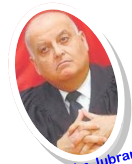
This is Salim Jubran, an Israeli Arab. Since May 2004 he has been a Justice on Israel's Supreme Court. Israeli Arabs serve on other Israeli benches and in Israel's Knesset.

Israel has led progress programs in 31 Black African nations plus Singapore, Thailand, Burma, and the Philippines.