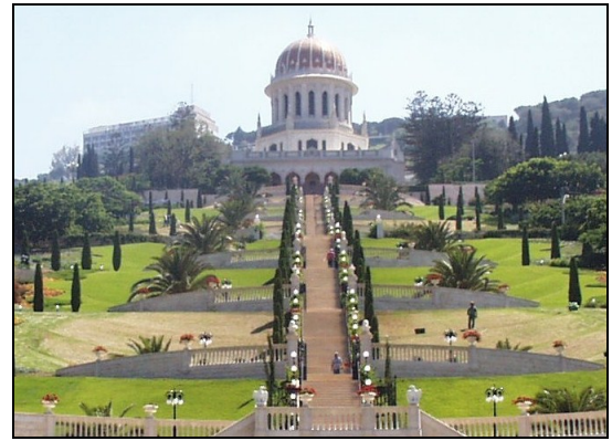
Haifa's Baha'i Temple, international headquarters of the Baha'i faith.