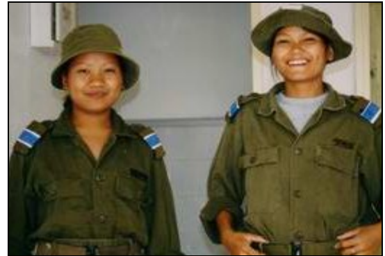
Some 1,000 people from the Bnei Menashe sect immigrated to Israel from India and elsewhere. They descend from the tribe of Menasseh and today are full citizens.