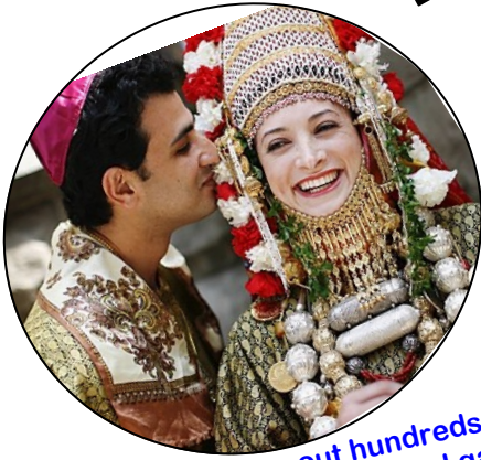
Arab nations threw out hundreds of thousands of Jews after Israel gained independence in 1948. These Israelis from Yemen celebrate their wedding.

If you think you know the real face of Israel, think again!