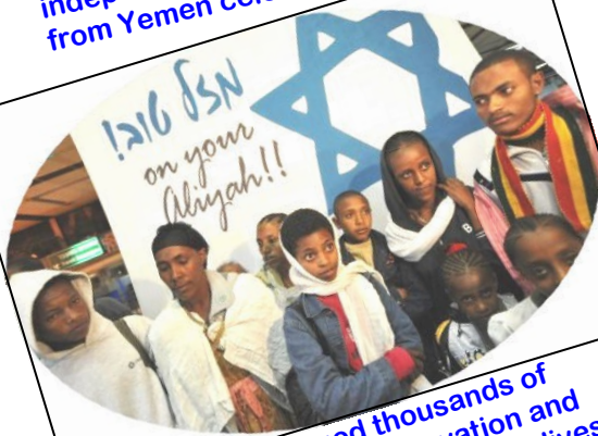
Israel has rescued thousands of Ethiopian Jews from starvation and persecution, offering them better lives.